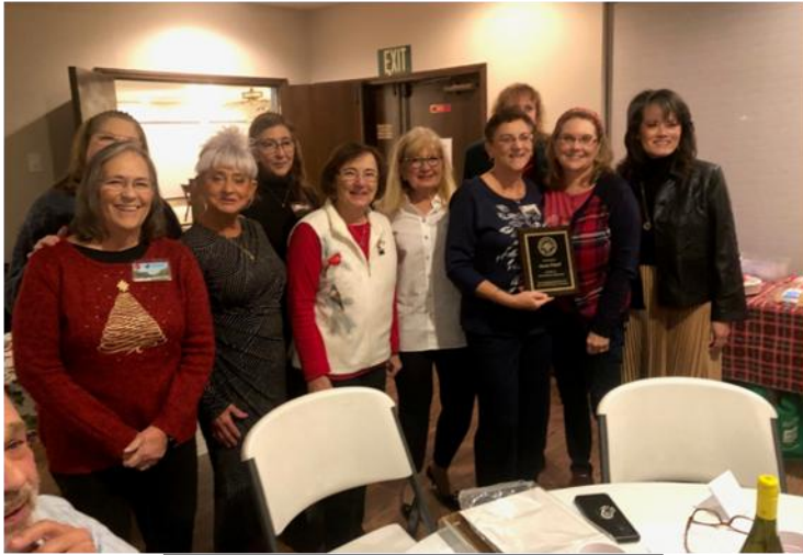
The KCMGCC Ladies Luncheon Group