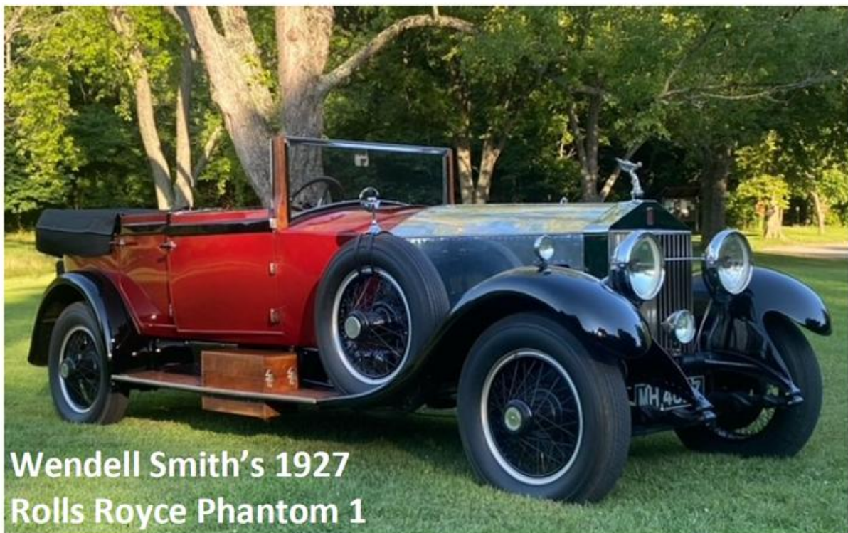
Wendell Smith's 1927 Rolls Royce Phantom 1